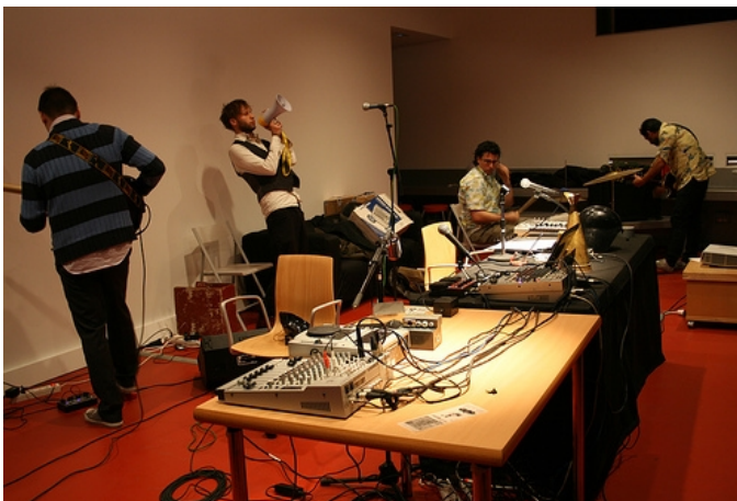
Gimferno performing at the 10 th AVLAB Meeting (December 2007)

The AVLAB meetings are monthly gatherings (one Saturday per month) of people with common interests in the fields of experimental, electronic and electro-acoustical music, sound art, interactive devices and live audio and video processing in general. The meetings arose out