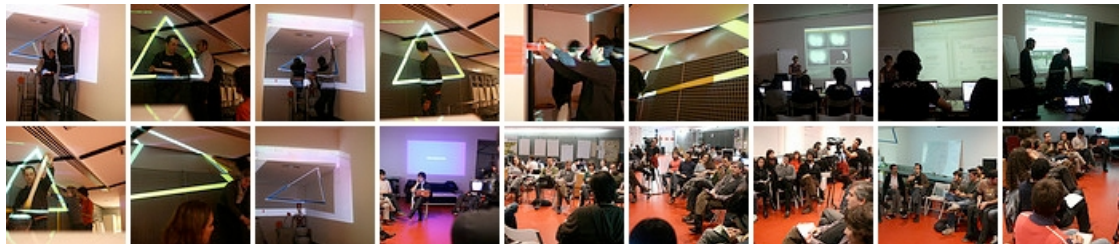
Light, space and Perception workgroup related events.

Medialab-Prado's work groups are made up of local and national users who get together periodically in order to tackle different topics and to develop projects in a collaborative environment. Up to now, there are four different groups: